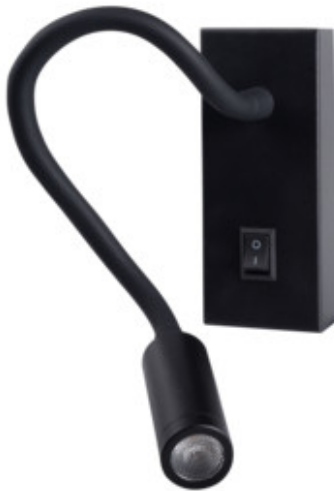
TONIL II LED B