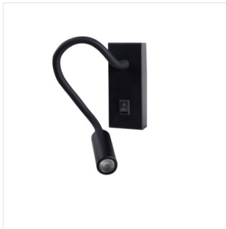
TONIL II LED B