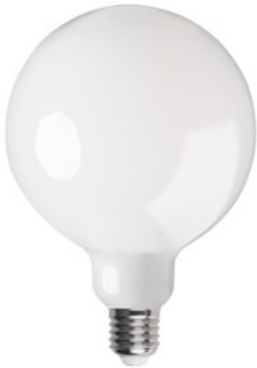
XLED G125 11W