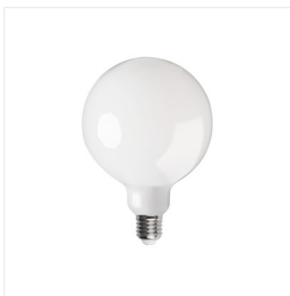
XLED G125 11W