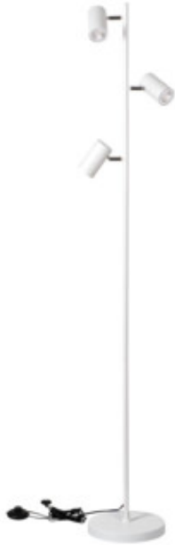
EVALO FL 3xGU10 W-SR