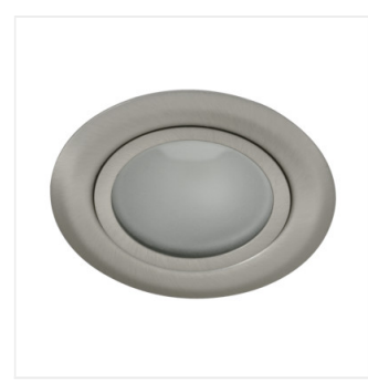
GAVI LED18 SMD-WW-C/M