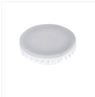
ESG LED 9W GX53