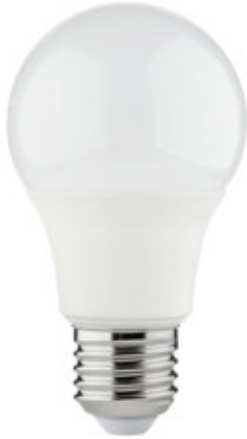
RAPID v2 E27-NW