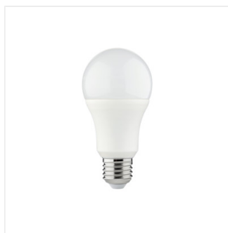
RAPID HI v2 E27-NW