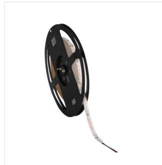
LEDS-B 4.8W/M IP54