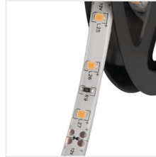
LEDS-B 4.8W/M IP00