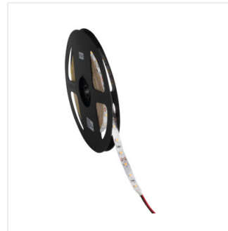
LEDS-B 4.8W/M IP65