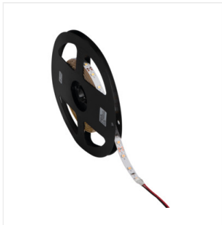
LEDS-B 4.8W/M IP00