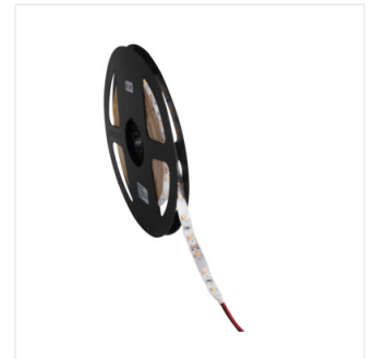
LEDS-B 4.8W/M IP65