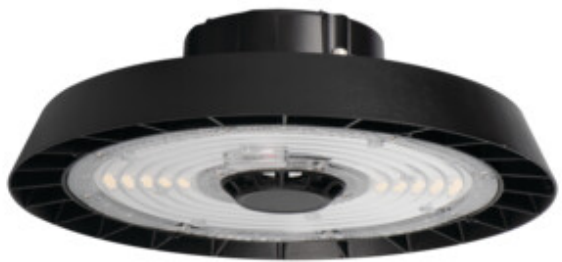
HB PROSTRONG 150WD