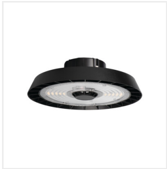
HB PROSTRONG 150WD