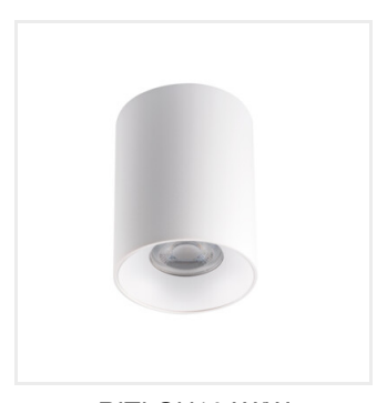
RITI GU10 W/W