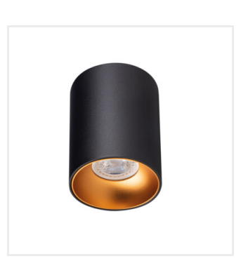
RITI GU10 B/G