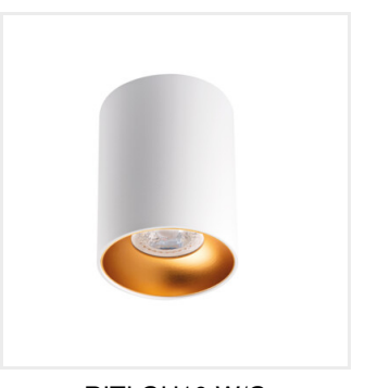
RITI GU10 W/G