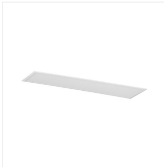
BRAVO S 40W12030NW W