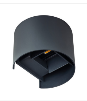
REKA LED EL 7W-O-GR