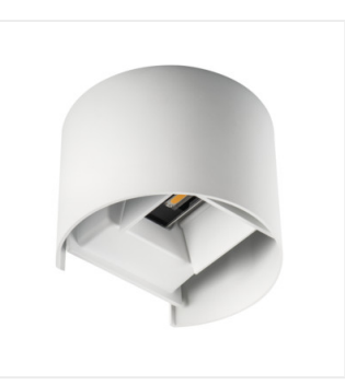
REKA LED EL 7W-O-W