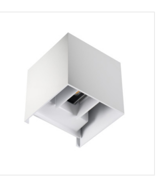
REKA LED EL 7W-L-W