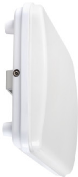
PORTOS LED SE