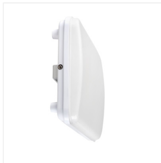
PORTOS LED SE