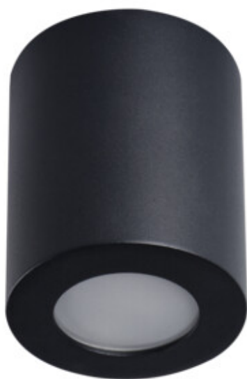
SANI IP44 DSO-B