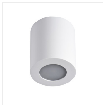
SANI IP44 DSO-W