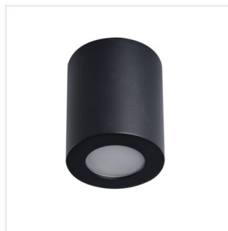
SANI IP44 DSO-B