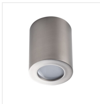
SANI IP44 DSO-SN