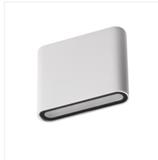
GARTO LED EL 8W-W