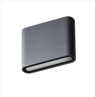
GARTO LED EL 8W-GR