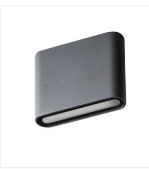
GARTO LED EL 8W-GR