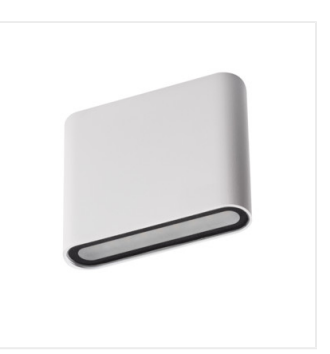
GARTO LED EL 8W-W