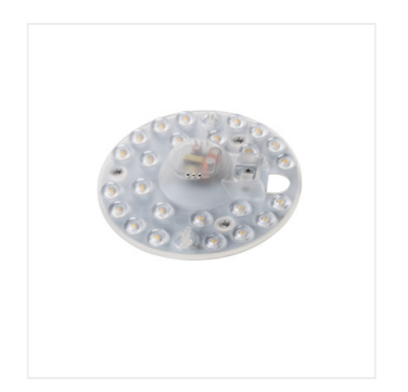
MODv2 LED 12W