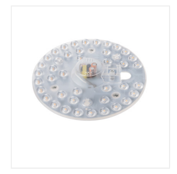
MODv2 LED 19W