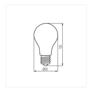
XLED A60 4,5W; 7W; 8W; 10W