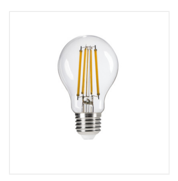
XLED A60 8W; 10W