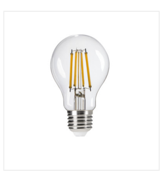
XLED A60 7W