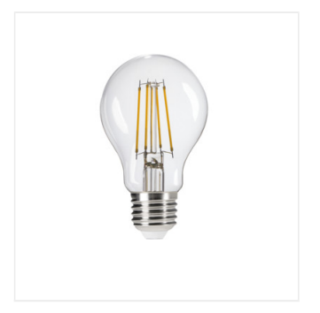
XLED A60 4,5W