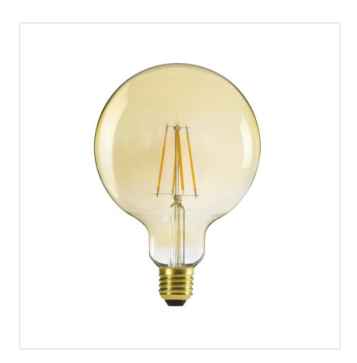
XLED G125 7W