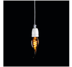
XLED C35T 2,5W-SW