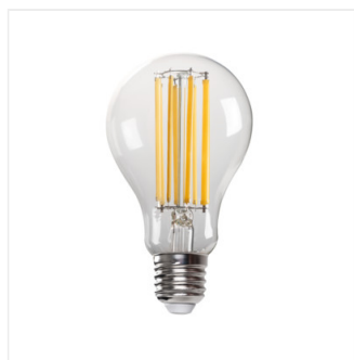
XLED A70 18W-WW