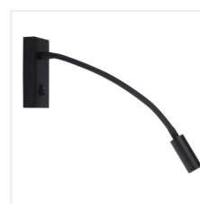
TONIL LED B