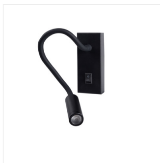
TONIL LED B