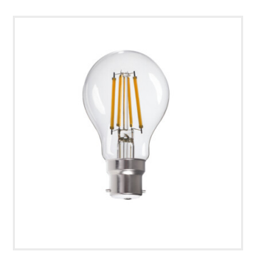
XLED A60 B22 7W