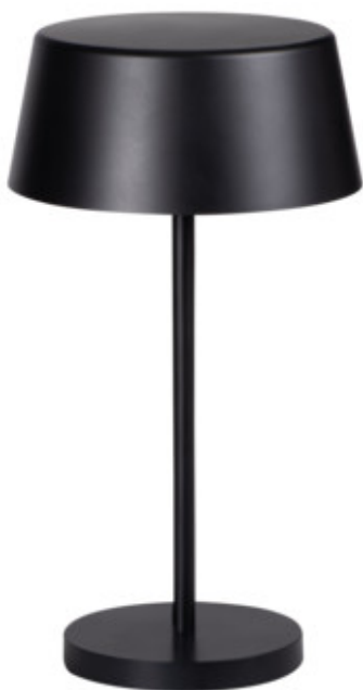
DAIBO LED T-B