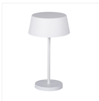
DAIBO LED T-W