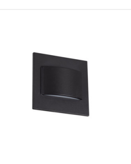
ERINUS LED O B