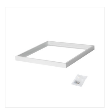
ADTR 6262 W