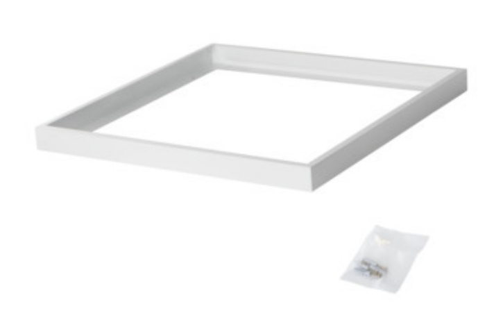
ADTR 6262 W