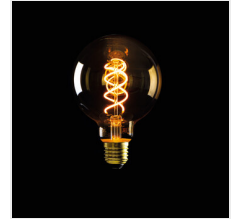
XLED G95 5W-SW