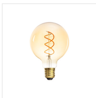
XLED G95 4W-SW