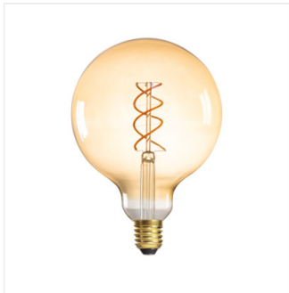
XLED G125 5W-SW