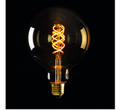
XLED G125 5W-SW