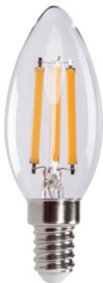
XLEDDIM C35E14 5,9W-WW