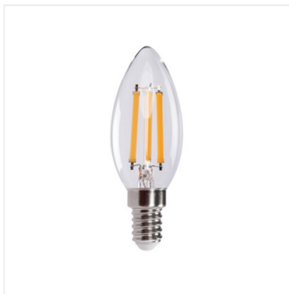
XLEDIM C35E14 5,9W-WW