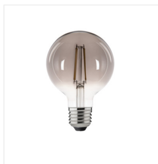
XLED G95S 5,8W-NW