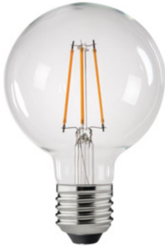
XLED G95C 7W-WW