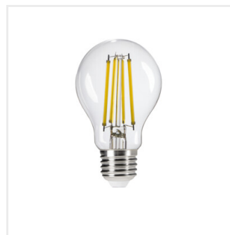
XLED EX A60 5W-NW