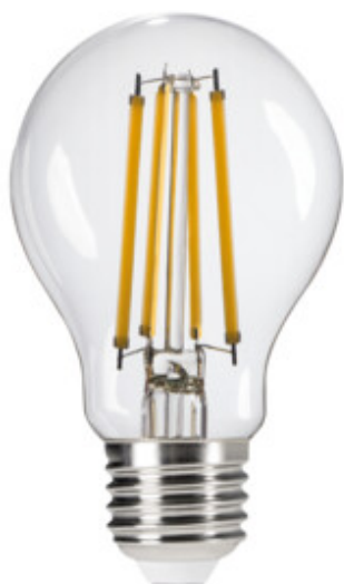
XLED EX A60 4W-WW