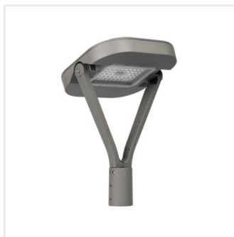
PARCOLI 30-50W CCT G