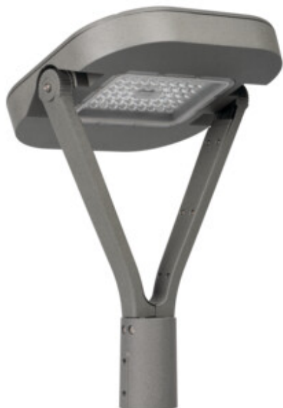
PARCOLI 30-50W CCT G