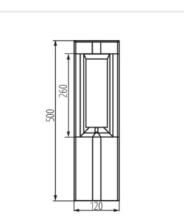
PEVO 50 GR