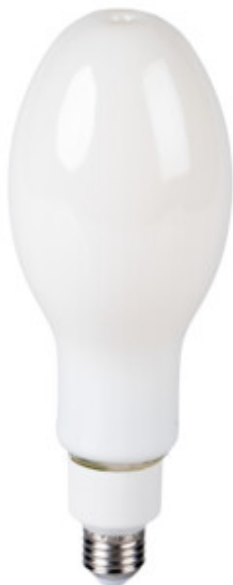
XLED HP D90E27 26W-NW