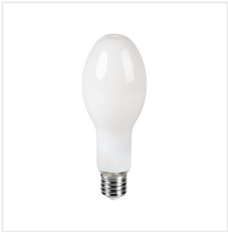
XLED HP D90E40 36W-NW