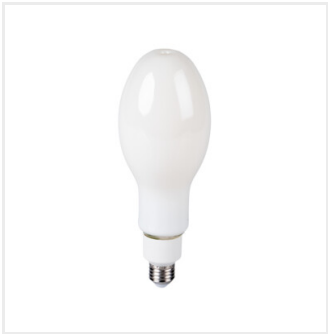
XLED HP D90E27 26W-NW