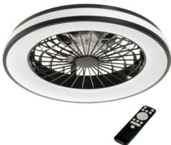
PLAVE LED CCT