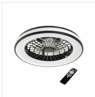
PLAVE LED CCT+RGB