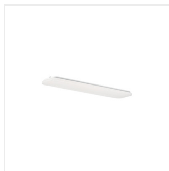
LINCEA 15-24W 07 CCT