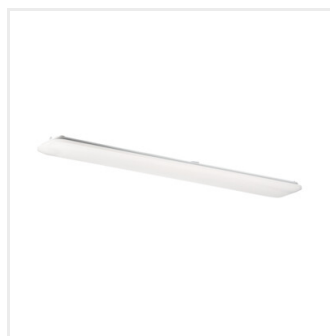
LINCEA 30-45W 12 CCT