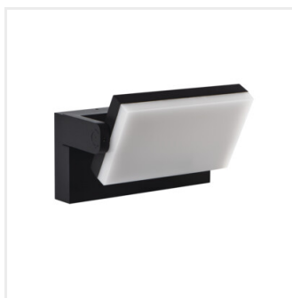
XERTO EL 20W B