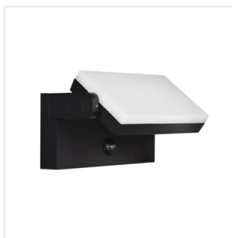
XERTO EL 20W SE B