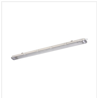
DICHT 4LED PI 236/PC