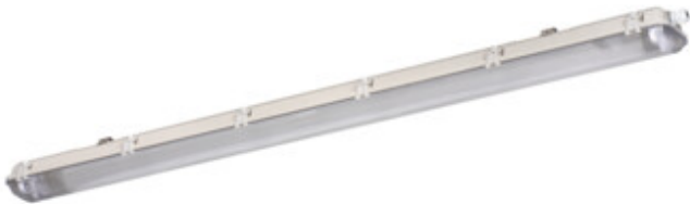
DICHT 4LED PI 236/PC