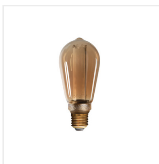
ST64 A 4W-SW