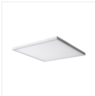
BAREV BL LEDN2 40W- NW