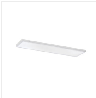
BAREV BL 40W 12030 NW