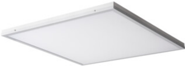
BAREV BL LEDN2 40W-NW