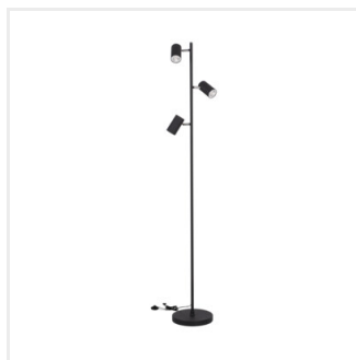
EVALO FL 3xGU10 B-SR