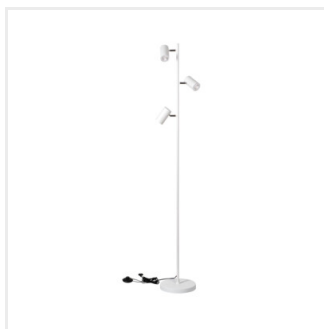
EVALO FL 3xGU10 W-SR