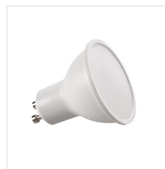
TOMiv2 6,5W GU10