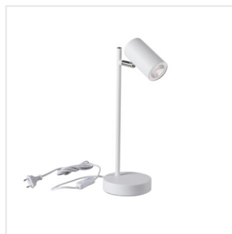
EVALO TL GU10 W-SR