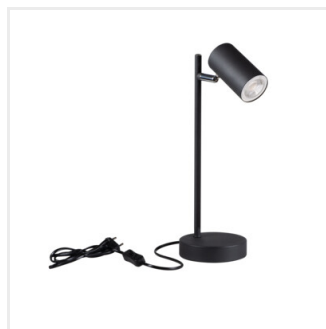
EVALO TL GU10 B-SR