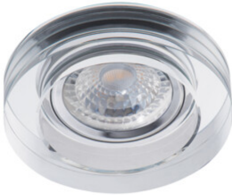
MORTA B CT-DSL50-B