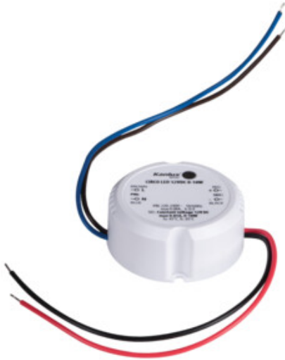
CIRCO LED 12VDC