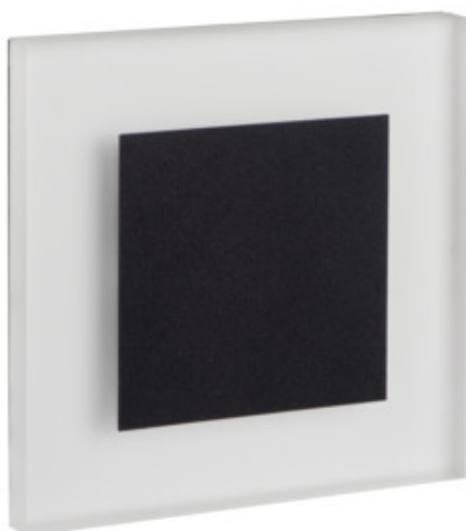
APUS LED B, APUS LED AC B