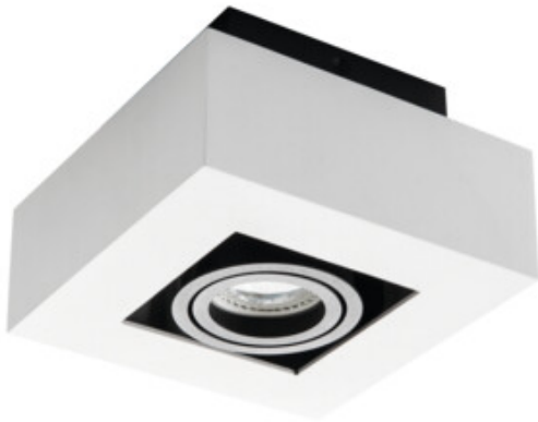
STOBI DLP 50-W