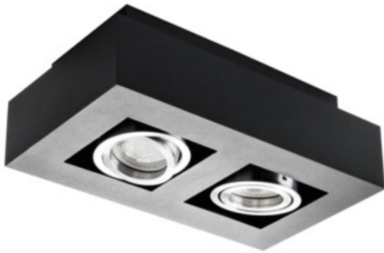
STOBI DLP 250-B