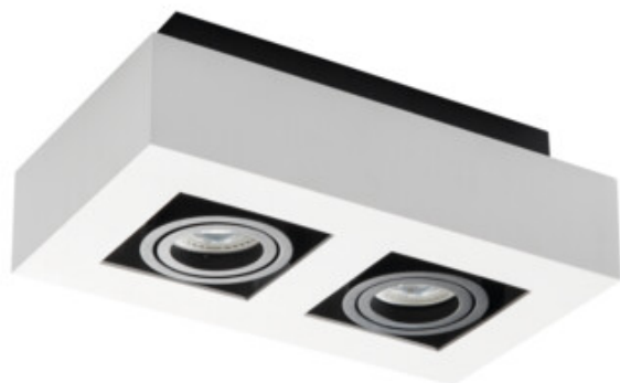
STOBI DLP 250-W