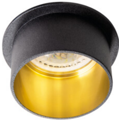
SPAG S B-G