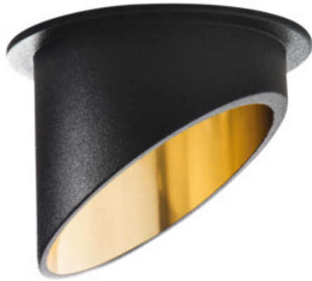
SPAG C B-G